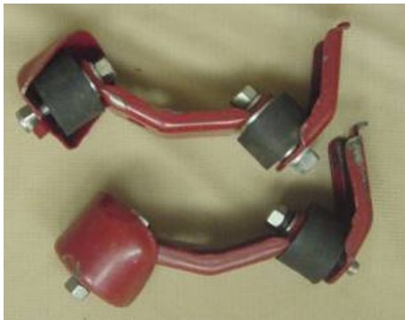
RENEWING THE MOUNTS in a Stepdown