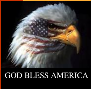
GOD BLESS AMERICA